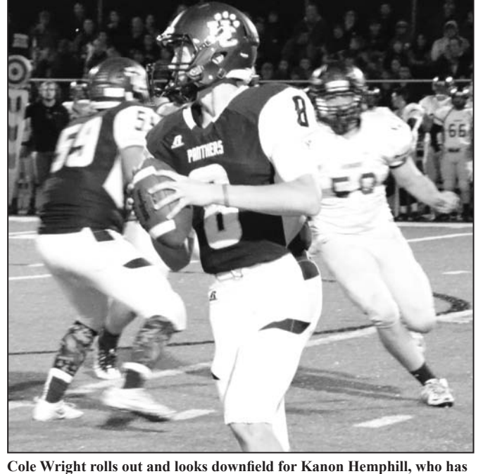
been his favorite target over the last two games.